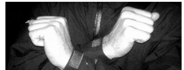
d. Block –This action will stop a proposal from being accepted unless retracted after further dialogue.