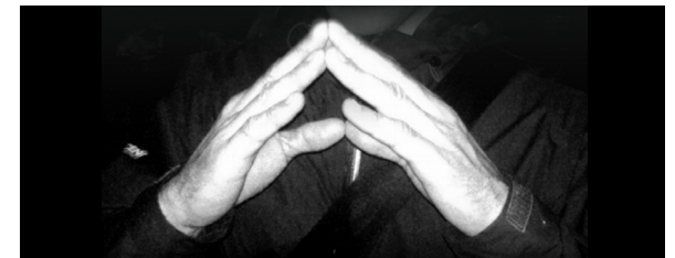
c. Point of Process – a valued interruption